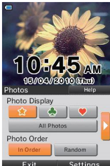
Photo Clock - Photo Clock turns your Nintendo DSi XL into a photo frame with added clock and alarm functions. Choose from a range of clock styles and alarms, and use the photo feature to display a slideshow of pictures from the Nintendo DSi Camera album.

A Little Bit of... Dr Kawashima's Brain Training™: Arts Edition – A Little Bit of... Dr Kawashima's Brain Training: Arts Edition features challenges with words, pictures and music to keep your brain sharp in just a few minutes a day. Engage your grey matter and have fun along the way.